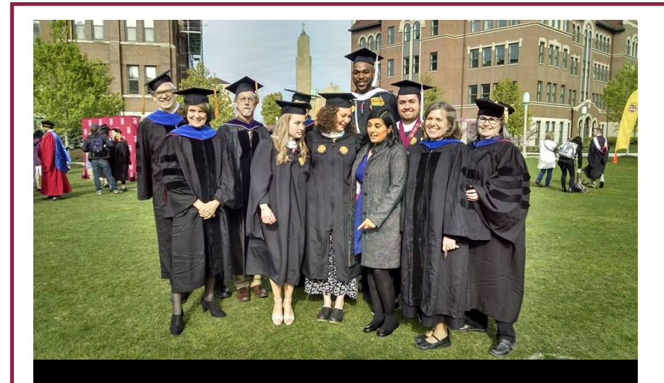
Graduating MA Students celebrate their graduation with faculty